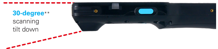
30-degree** scanning tilt down