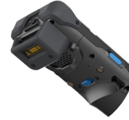
Long range version EX30 Near-Far imager 20m reading distance*